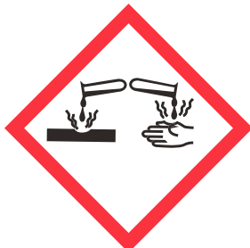
CONTAINS CHROMIUM (VI)

DANGER Causes skin irritation. Harmful if swallowed. Causes serious eye damage. May cause respiratory irritation. Keep out of reach of children. Avoid breathing dust. Wear protective gloves and eye protection. Wash hands thoroughly after handling. IF SKIN IRRITATION OCCURS: Get medical advice/attention. IF SWALLOWED: Call a poison centre or doctor/physician if you feel unwell. IF IN EYES: Rinse cautiously with water for several minutes. Remove contact lenses, if present and easy to do. Continue rinsing. Immediately call a poison centre or doctor/physician. Dispose of contents/container in accordance with local/regional regulations. Repeated exposure may cause skin dryness and cracking. CONTAINS CHROMIUM (VI) May produce an allergic reaction. To avoid risks to human health and the environment, comply with instructions for use. Safety data sheet available on request.