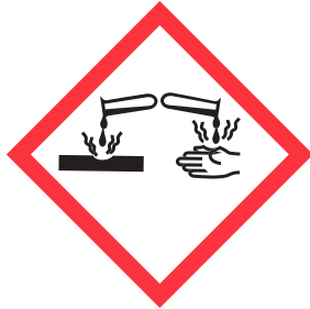
CONTAINS CHROMIUM (VI)

DANGER Causes skin irritation. Harmful if swallowed. Causes serious eye damage. May cause respiratory irritation. Keep out of reach of children. Avoid breathing dust. Wear protective gloves and eye protection. Wash hands thoroughly after handling. IF SKIN IRRITATION OCCURS: Get medical advice/attention. IF SWALLOWED: Call a poison centre or doctor/physician if you feel unwell. IF IN EYES: Rinse cautiously with water for several minutes. Remove contact lenses, if present and easy to do. Continue rinsing. Immediately call a poison centre or doctor/physician. Dispose of contents/container in accordance with local/regional regulations. Repeated exposure may cause skin dryness and cracking. CONTAINS CHROMIUM (VI) May produce an allergic reaction. To avoid risks to human health and the environment, comply with instructions for use. Safety data sheet available on request.