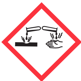
CONTAINS CHROMIUM (VI)

DANGER Causes skin irritation. Harmful if swallowed. Causes serious eye damage. May cause respiratory irritation. Keep out of reach of children. Avoid breathing dust. Wear protective gloves and eye protection. Wash hands thoroughly after handling. IF SKIN IRRITATION OCCURS: Get medical advice/attention. IF SWALLOWED: Call a poison centre or doctor/physician if you feel unwell. IF IN EYES: Rinse cautiously with water for several minutes. Remove contact lenses, if present and easy to do. Continue rinsing. Immediately call a poison centre or doctor/physician. Dispose of contents/container in accordance with local/regional regulations. Repeated exposure may cause skin dryness and cracking. CONTAINS CHROMIUM (VI) May produce an allergic reaction. To avoid risks to human health and the environment, comply with instructions for use. Safety data sheet available on request.